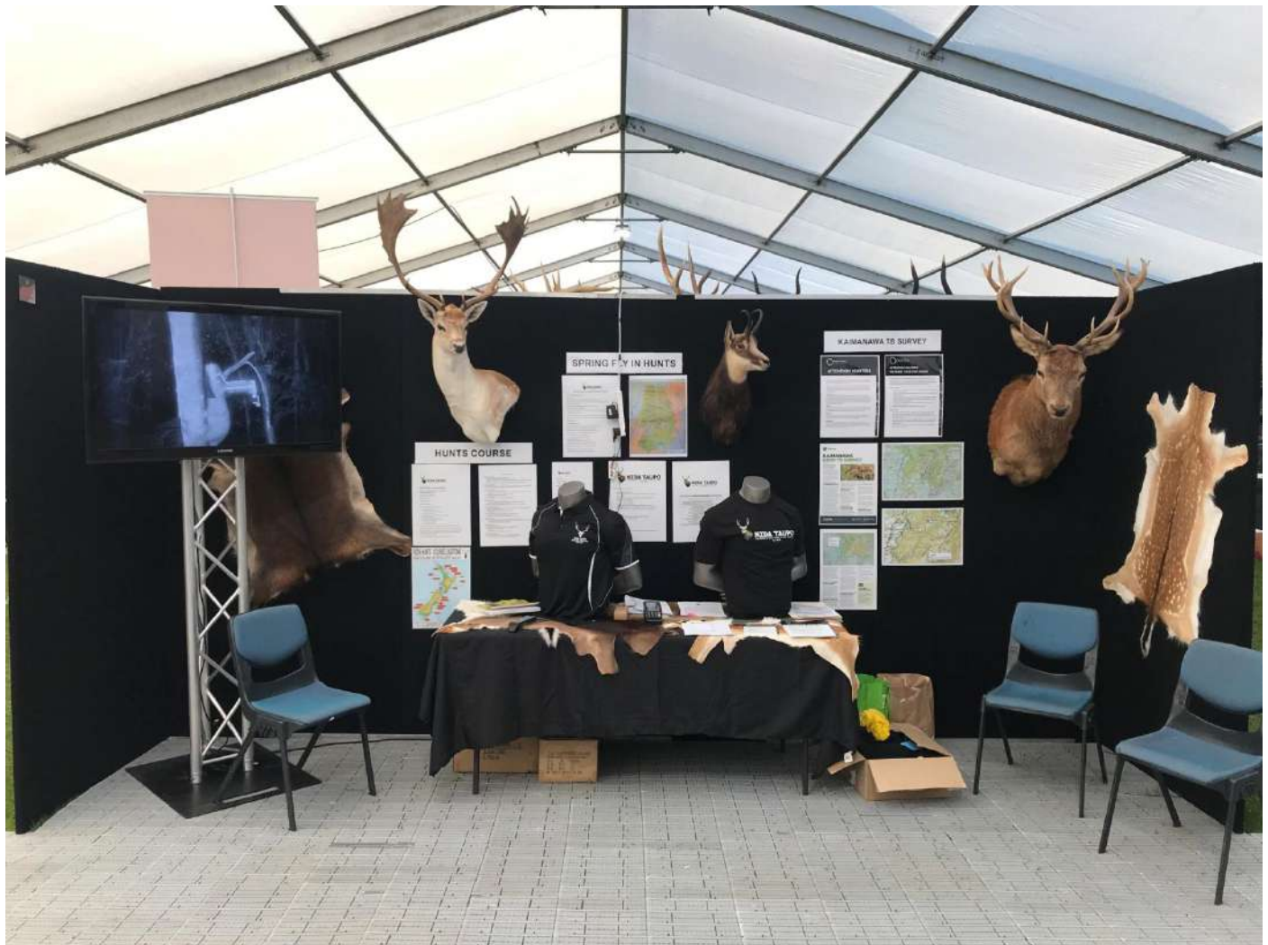
NZDA Taupo Branch stand at the Sika Show

Disclaimer: As the contents of this magazine come from various sources, the opinions or ideas expressed are not necessarily endorsed by this committee or by National Executive, nor may they conform to branch or national policy. The official publication of the NZDA is the 'NZ Hunting and Wildlife'.